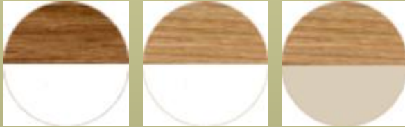
Dark WoodGrain On White